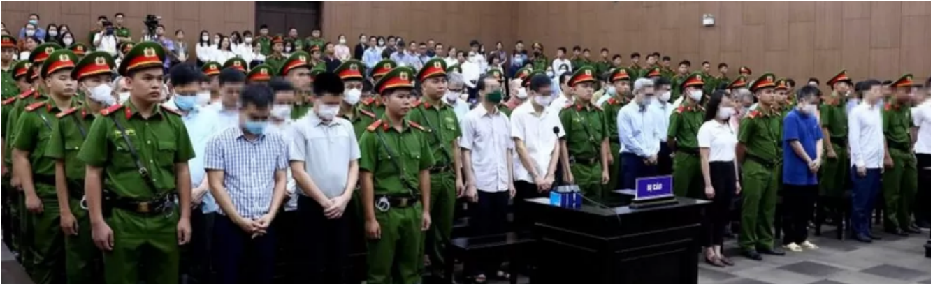
Vietnam jails 50 people in mass bribery trial ( BBC News )

Corruption poses a significant threat to society, but it occurs in the shadows, masking its true effects. Before tackling corruption, researchers, policy analysts, and officials must first measure its frequency and scope with effective techniques or risk exacerbating its effects.